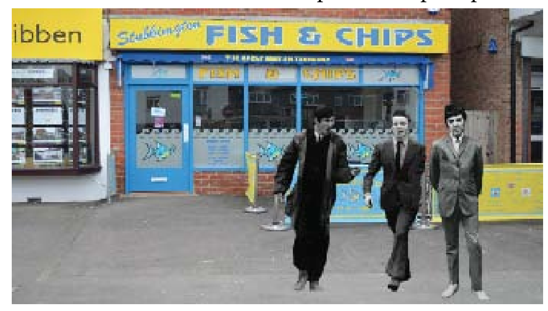
[Dave's Mate 1]:

"What's Up Dave, Mate you're looking a bit down?"