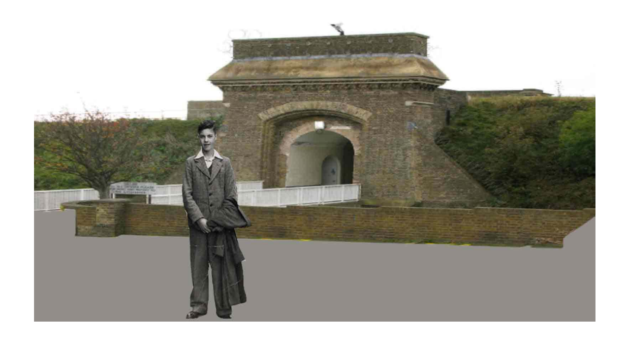
[Dave]: I don't like these cloths they don't suite me. I can't be seen dressed like this. I know what I an going to do!

Cast Required Dave Villain Firm Dave's Dodgy Mates Drug Dealer