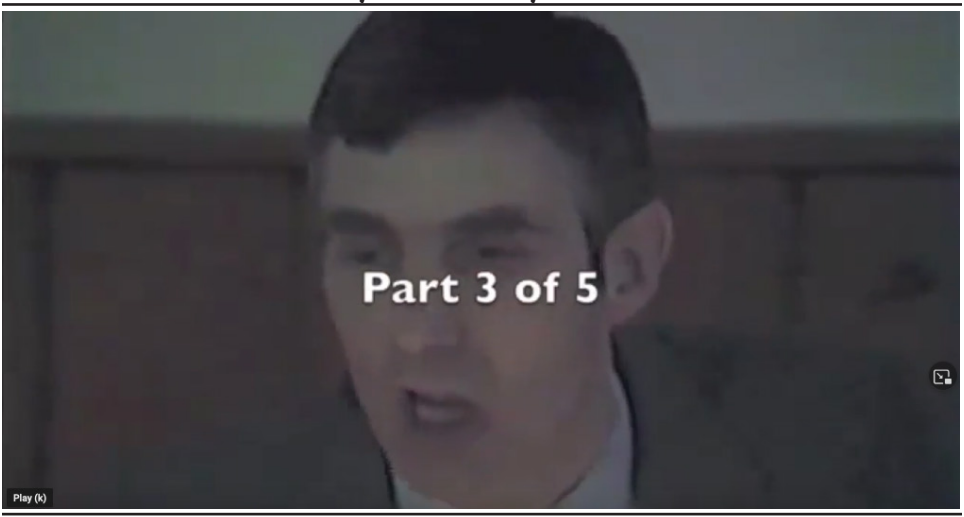
Click To view YouTube <a href="https://youtu.be/nhGlR1xc">https://youtu.be/nhGlR1xc</a> so