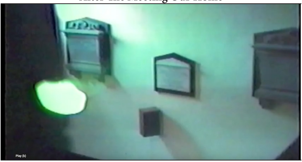
Click to view YouTube <a href="https://youtu.be/J3jp6xbuMMM">https://youtu.be/J3jp6xbuMMM</a>