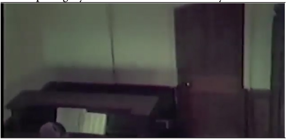
Click to view YouTube Video_ https://youtu.be/ ANM2Cf8lKw

Opening Hymn Introduction Denham's Hymn 367