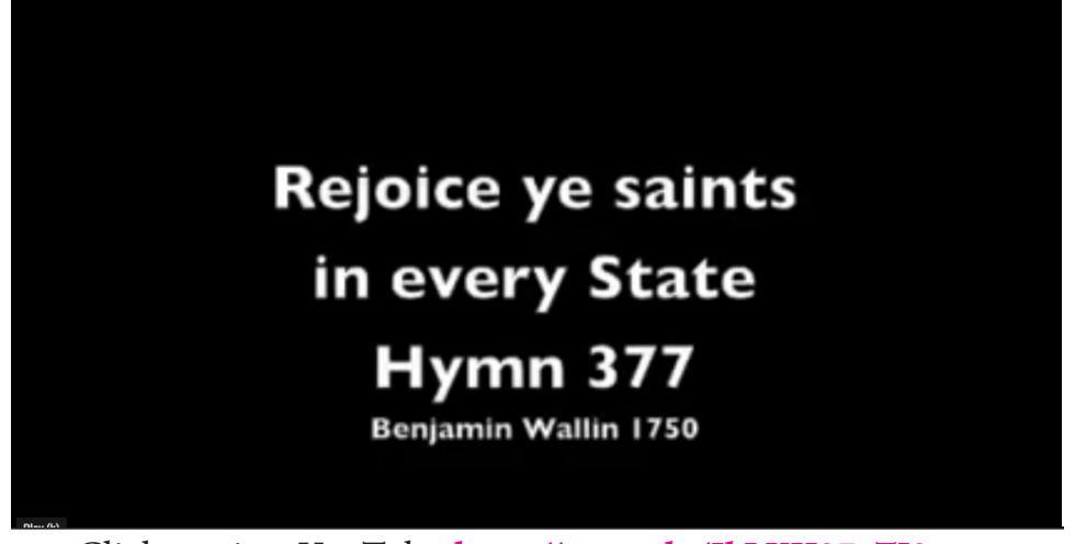
Closing Hymn 377

Click to view YouTube <a href="https://youtu.be/IkLKH97yTJ8">https://youtu.be/IkLKH97yTJ8</a>