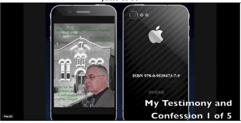
Click to view YouTube My Testimony 1 of 5 <a href="https://youtu.be/64wspIDjo28">https://youtu.be/64wspIDjo28</a>