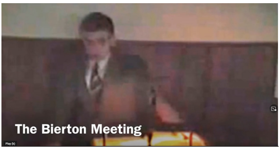
Click To view YouTube <a href="https://youtu.be/pCszM0h-dAs">https://youtu.be/pCszM0h-dAs</a>